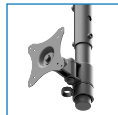
Smart cable management