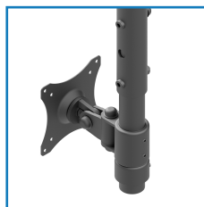
Tilt adjustment and rotation